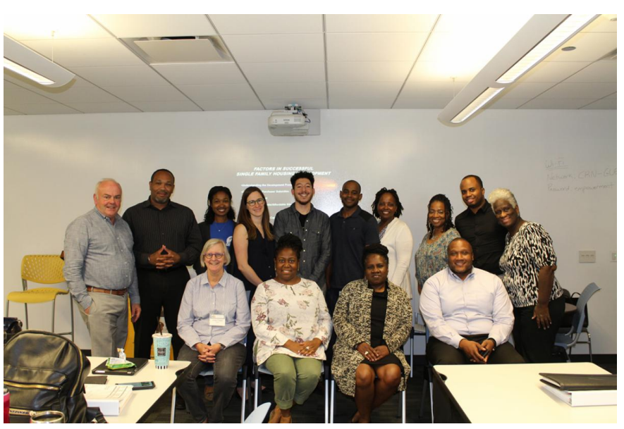
During September's Single Family Housing Development Workshop, students learned the basics of single family development including assembling a development team, acquiring property, securing financing, and marketing.