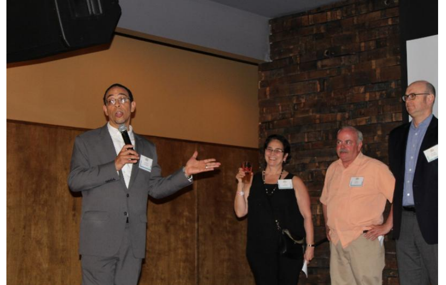
DPD Deputy Commissioner Anthony Simpkins addresses attendees.