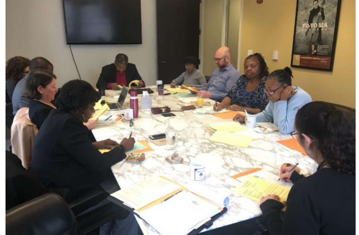
CRN leadership reviews board documents and prepares for a summer of impact for neighborhood development and affordable housing.