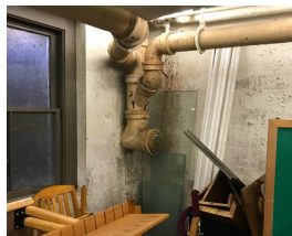
Left: Independence Apartments and Library in Irving Park. Right: Water damage at Douglass Library.