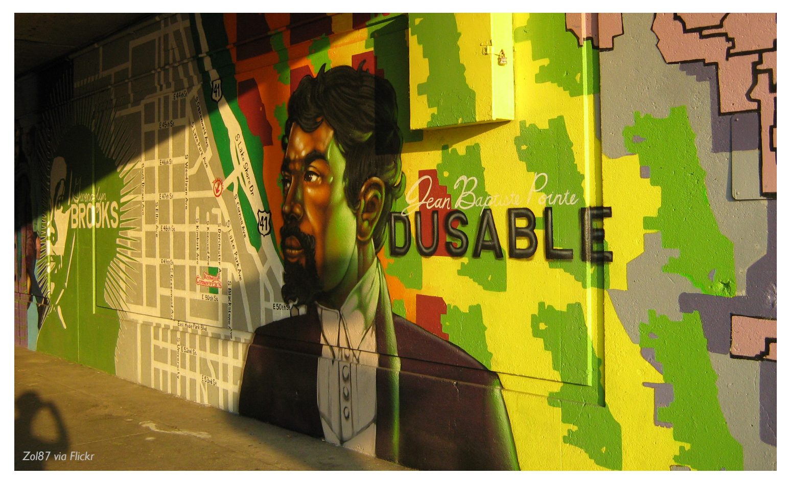
DuSable and Brooks Mural at 47th St Metra Electric Viaduct

source: CRN analysis of DHED Quarterly Reports, 2009 to 2013 (Q1)