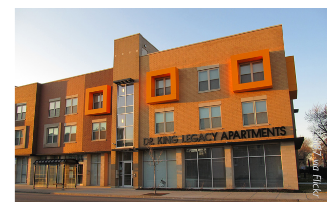
Lawndale Christian Development Corporation's King Legacy Apartments, built in Lawndale during the last housing plan

In economic terms, the jobs of the people hired on a temporary basis to actually build the housing are referred to as "direct jobs." The jobs of the people working in the construction supply chain, as well as whatever business services are required to execute the project, are referred to as "indirect jobs." These are the jobs that depend on the construction industry to survive. Finally, both these indirect and direct workers go home at the end of the day and spend their payroll on the costs of living in their neighborhoods, on everything from rent to purchases in local shops and restaurants. The jobs of people providing the goods and services for these neighborhood purchases are referred to as "induced jobs." In this way, the funds introduced into the economy through $1.1 billion in affordable housing development have ripple effects through these three job types that support local workers and deliver local taxes.