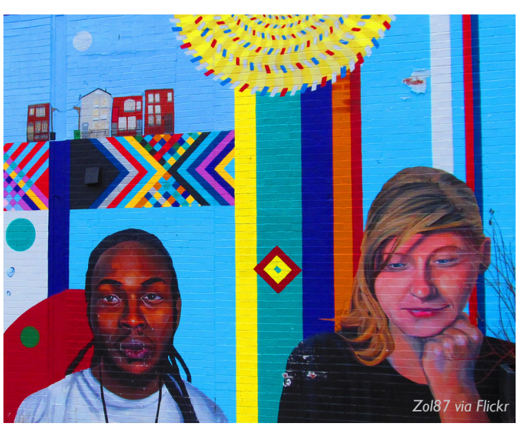
Wicker Park mural

This large stock of unoccupied, often unsecured, housing represents a challenge and an opportunity. On the one hand, the clock is ticking on this enormous stock of properties sitting in limbo either in the courts or on bank's balance sheets; the more time passes, the more likely it is that the properties will deteriorate or be stripped of value. On the other hand, programs aimed at helping people buy properties out of foreclosure represent an opportunity for many moderate-income Chicagoans to purchase single family homes and investment rental properties at affordable market rates.