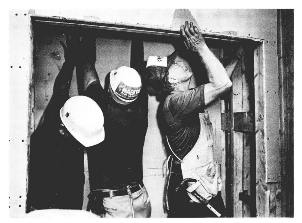
Jimmy Carter at work.