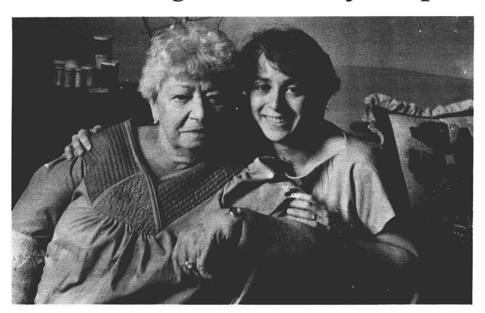
by Ruth Sherman

Years ago, when someone's relative was coming over from the "old country" it was not unusual to hear the following conversations: