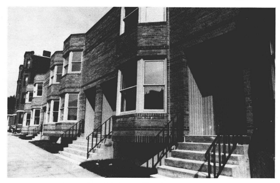
Townhouses built by the Nonprofit Housing Company