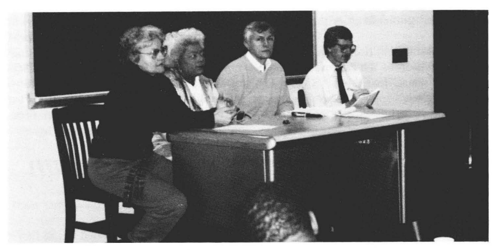
More than 70 people attended SHAC's founding convention in January.

Obviously, state coalitions present formidable challenges—particularly if the state has a wide mix of highly urban and rural areas and is 400 miles long. Still, the groups who came together on Jan. 25 found a large amount of common ground. Issues repeated most often included: lack of effective low-income housing programs by IHDA, abandoned housing, interest in a housing trust fund