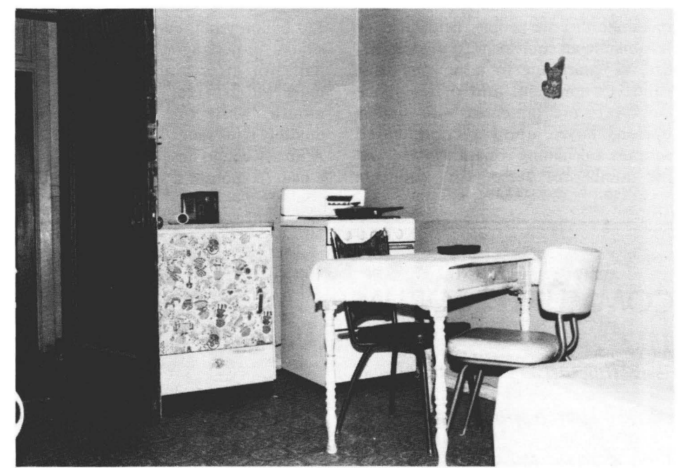
A typical SRO room.