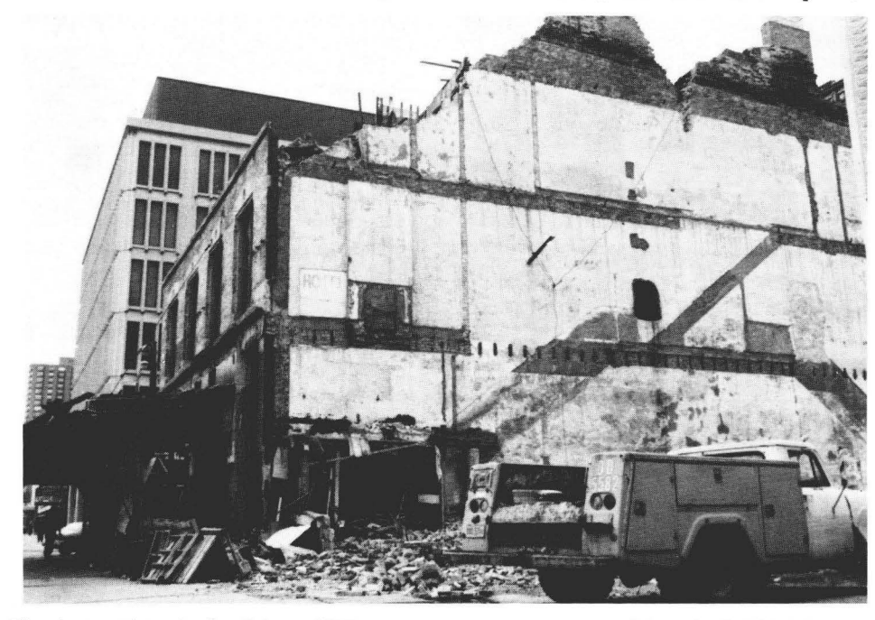
The destruction of a South Loop SRO.

On the basis of these findings, JCUA and CESO have formed recommendations for the preservation and improve-