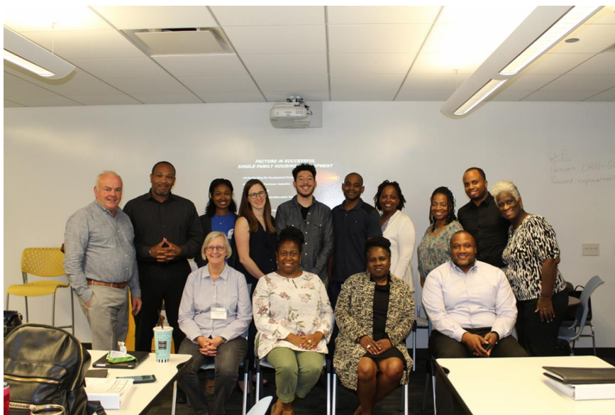
During September's Single Family Housing Development Workshop, students learned the basics of single family development including assembling a development team, acquiring property, securing financing, and marketing.