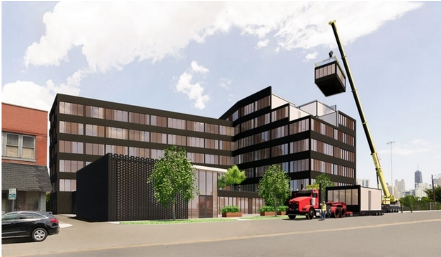
Rendering of apartment built through modular construction.

Chicago contractor Skender is leasing factory space on the southwest side where as many as 100 people will work on building apartments and hotel rooms that will be snapped together on construction sites. The first project is a six-story, 110-unit apartment building in the West Loop. Read more here .