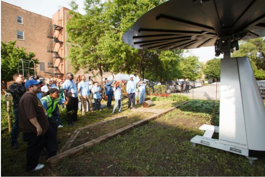
The crowd in TRC's garden watches the new smartflower position its petals.