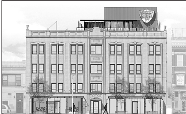
A 91-unit SRO hotel at 3208 N. Sheffield will be converted into 51 units of affordable permanent supportive housing designed for adults at risk of homelessness and/or with severe mental illness.

BT-Development, comprised of Brinshore Development LLC and The Thresholds social service agency, was selected from seven developers that responded to a City request for redevelopment proposals last year. The rehabilitation plan for the four-story building features a rooftop garden with solar panels along with ground-floor retail space, including a flower shop that will be staffed by building residents.