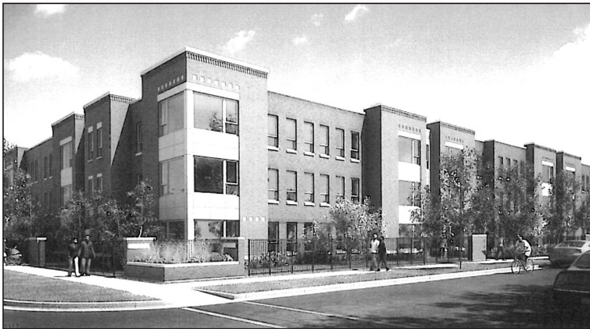
The recently opened Park Douglas development contains 137 mixed-income units located in the vicinity of Roosevelt Road and California Avenue in the North Lawndale community.

The new, limestone-accented residences were constructed among existing vintage buildings, some of which already have been renovated. The project, approved in 2010 as a part of the CHA's Plan for Transformation, was made possible through the donation of City-owned land along with HED loans and tax credits valued at more than $30 million.