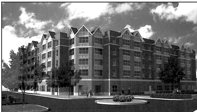
Senior Suites of Midway Village represents the final phase of a 239-unit complex featuring a mix of rental and condo residences.

When completed, the L-shaped structure will include studio, one- and two-bedroom apartments as well as a dining room, laundry facilities, a library and management offices. The Midway Village senior campus already contains a 126-unit rental building and two 12-unit condominium buildings.