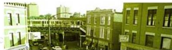
Two-thirds of Chicago households earn less than $75,000 a year.