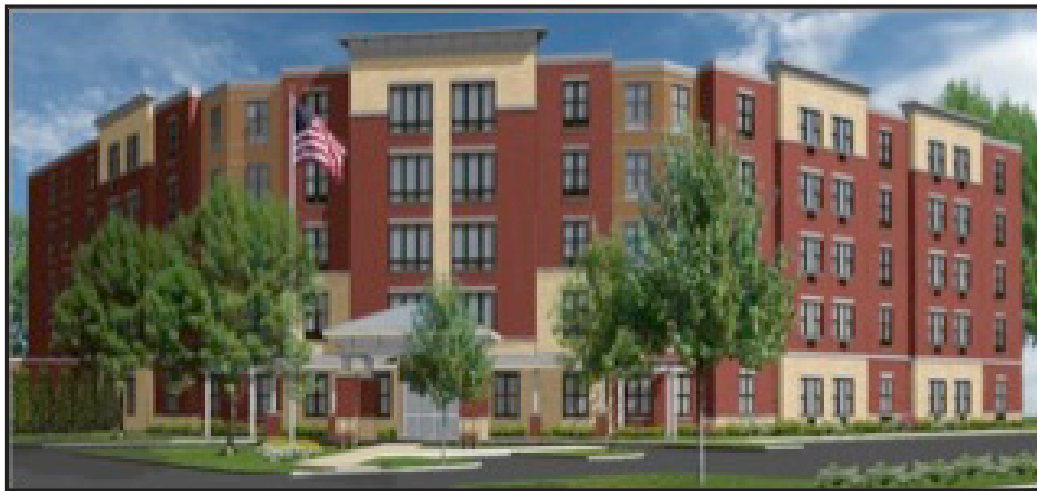
Construction of this five-story residential building at 4339-47 W. 18th Place will provide much-needed affordable housing and supportive services for Lawndale seniors.

The facility will be constructed on two parcels of City-owned vacant land, valued at $220,000, which will be conveyed to the developer for $1. Additional funding sources include a $12.2 million HUD loan and a $191,000 state grant.